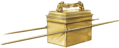
Poles for Carrying Ark on Shoulders